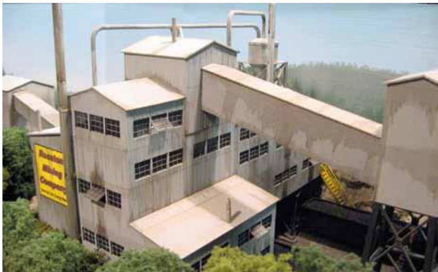
6. Rick kitbashed the Rosston coal mine complex from a Walthers New River mine kit that he expanded with a scratchbuilt processing building on the left.

most of them. This allowed me to use the back wall from each kit as low-relief structures seen from the rear. All of my retail buildings are about 2" deep.