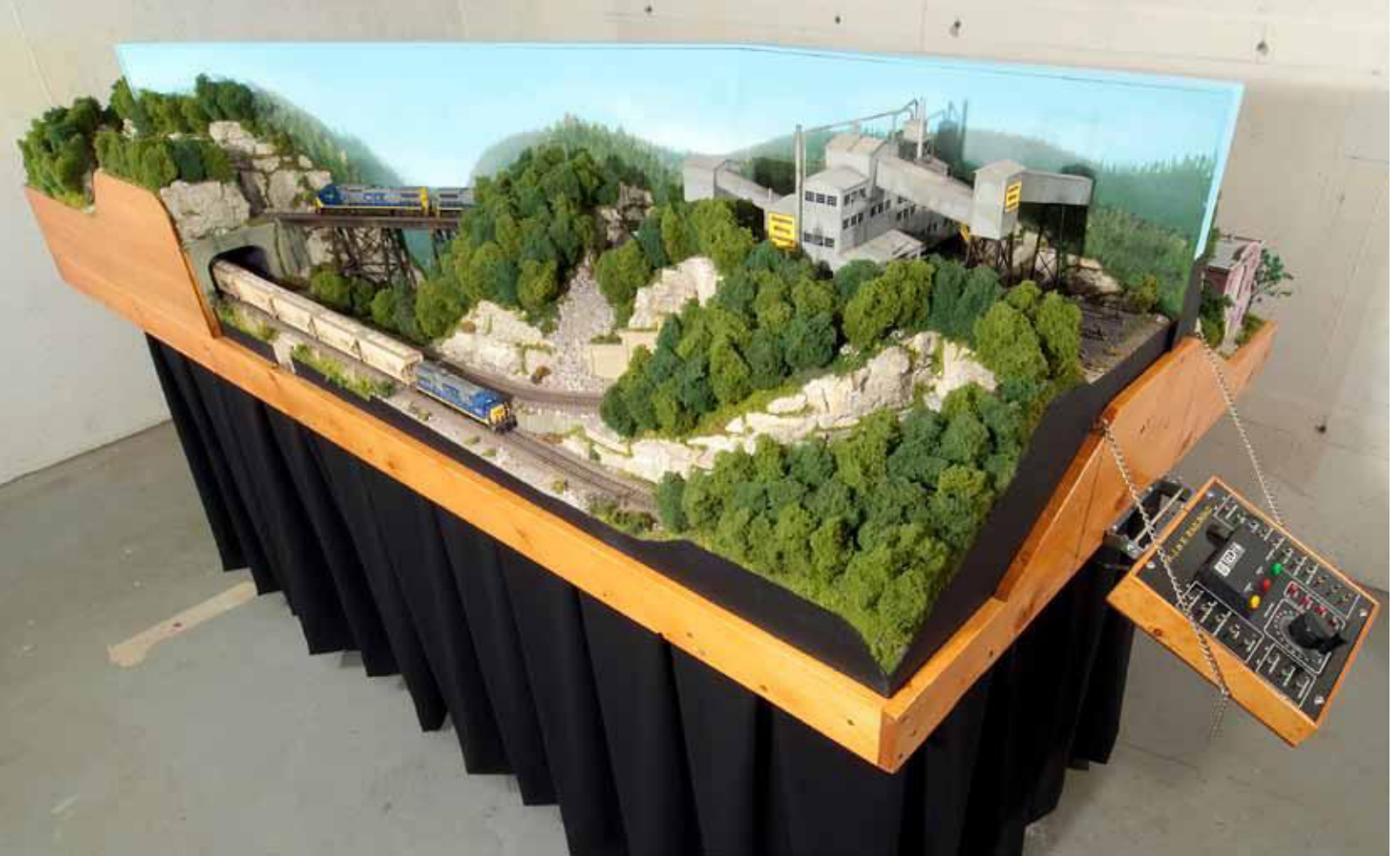
2. This "aerial" view shows the control panel and how the diagonal double-sided backdrop separates the coal mine scene from the urban area.