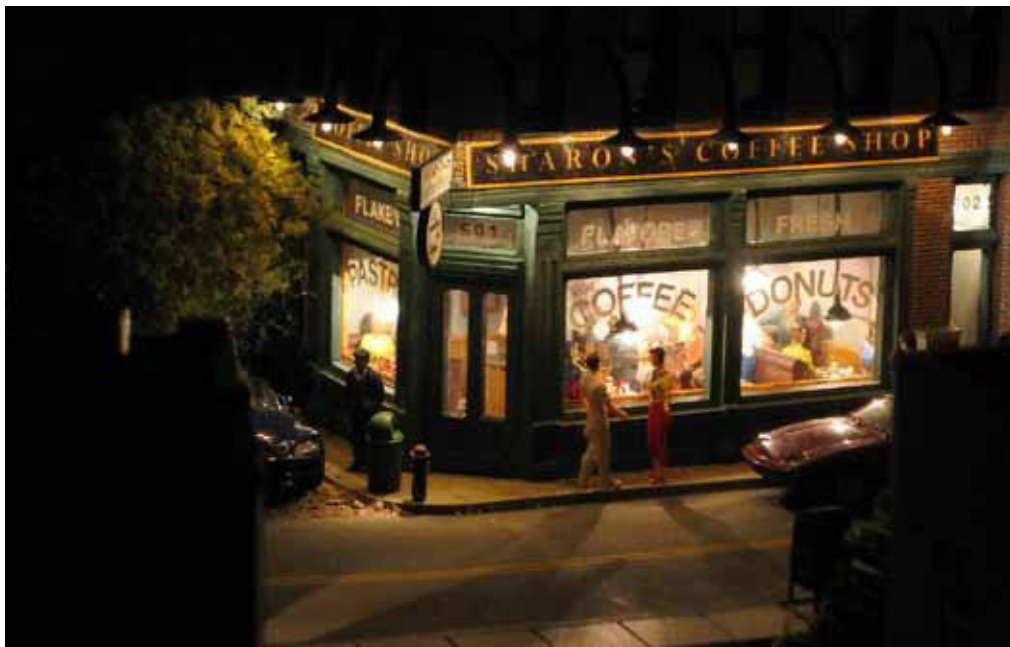
5. Because of its prominent location, Rick carefully detailed and lighted the interior of Sharon's Corner Cafe so it would stand up to close inspection.

Almost all of the Main Street structures are kitbashed so I could compress them into a small footprint. Although I maintained the width of each structure, I drastically reduced their depth and only used the front and two sides on