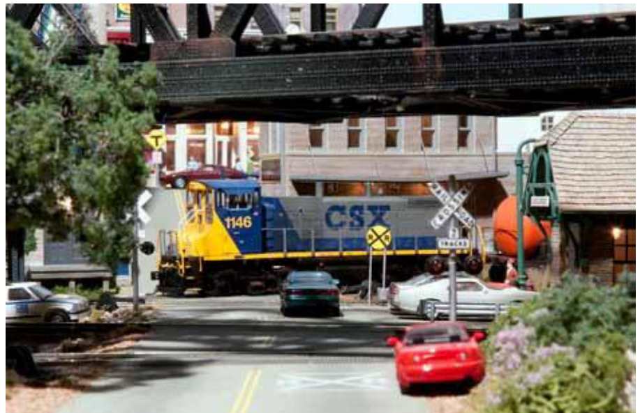
3. An Atlas CSX MP15DC blocks the Maple Street grade crossing as it switches cars at the Cargill elevator. Well planned detailing and use of the proper highway warning signs and pavement markings adds realism for closeup viewing.

A scenic backdrop separates the town from the Rosston mining area, so I began the scenery by painting both sides